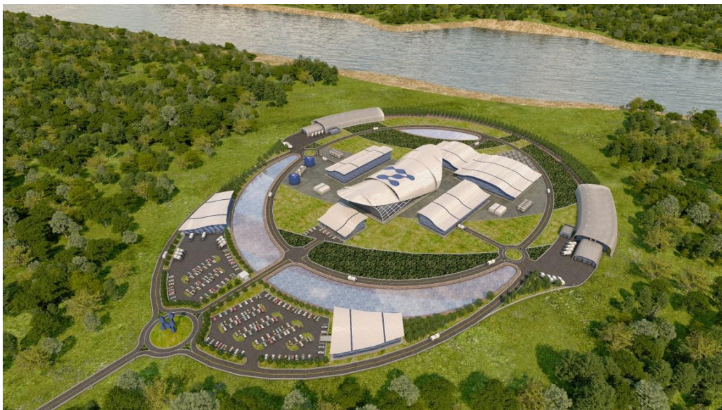
Image: NuScale Power SMR, 12 x 77 MWe modules, 924 MWe total on an 18 hectare site.

The retirement of coal-fired power stations in the NEM provides an opportunity to re-use or re-purpose the infrastructure, retain jobs and maintain the life of local communities by repowering the sites with Small Modular Reactors.