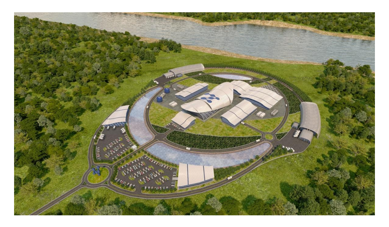
Image: NuScale Power SMR, 12 x 77 MWe modules, 924 MWe total on an 13 hectare site. US Nuclear Regulatory Commission (NRC) Final Safety Evaluation Report issued in August 2020 - first SMR to achieve NRC design approval.