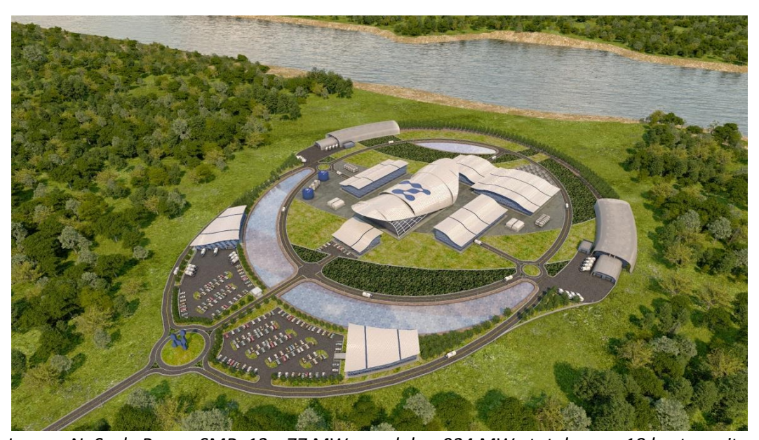
Image: NuScale Power SMR, 12 x 77 MWe modules, 924 MWe total on an 18 hectare site.

The retirement of coal-fired power stations in the NEM provides an opportunity to re-use or re-purpose the infrastructure, retain jobs and maintain the life of local communities by repowering the sites with Small Modular Reactors.