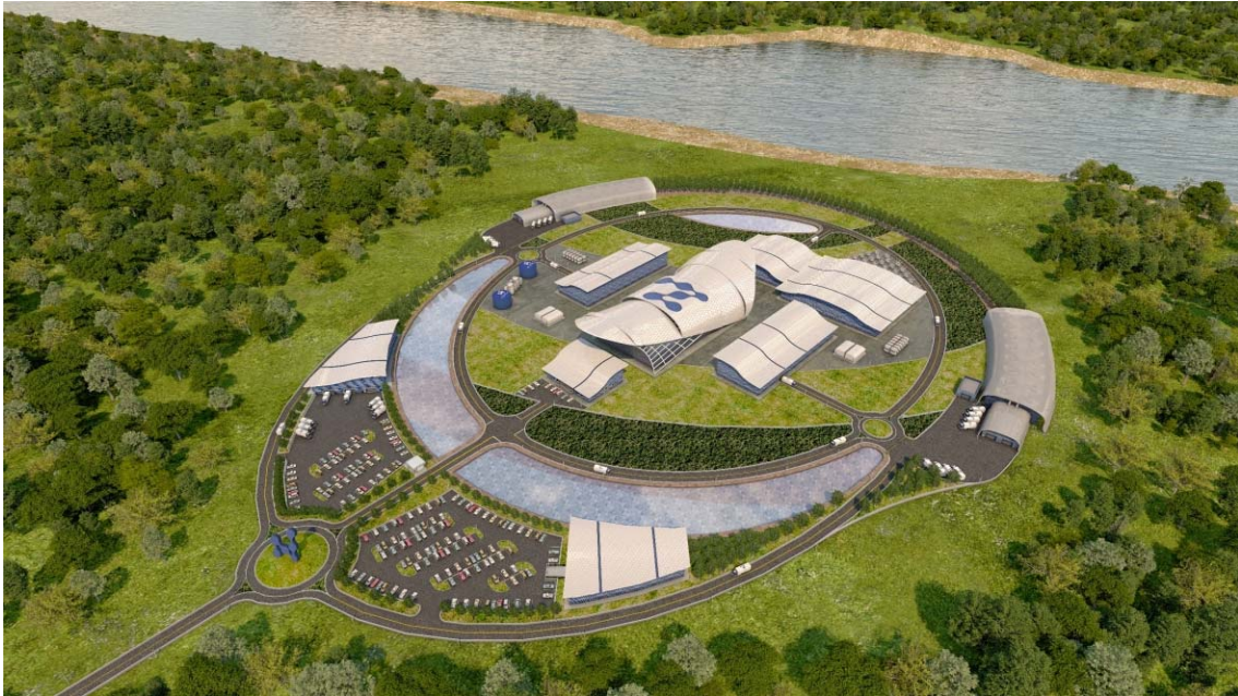
Image: NuScale Power SMR, 12 x 77 MWe modules, 924 MWe total on an 13 hectare site. US Nuclear Regulatory Commission (NRC) Final Safety Evaluation Report issued in August 2020 - first SMR to achieve NRC design approval.