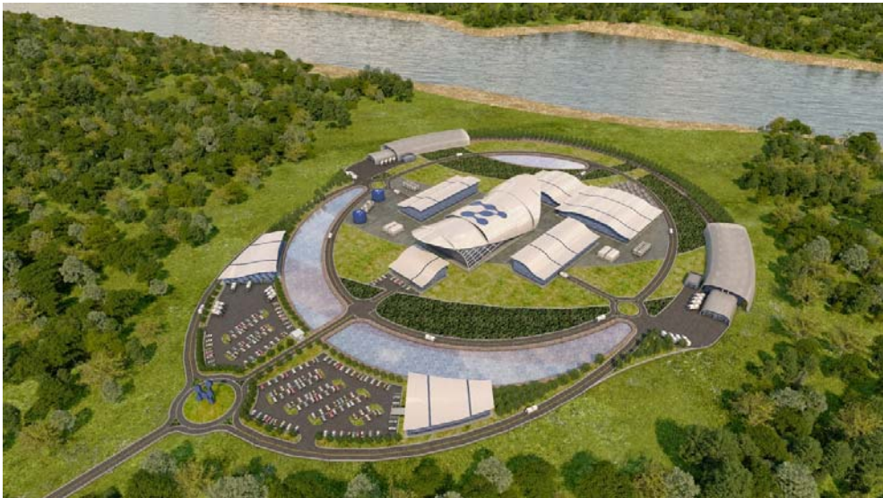
Image: NuScale Power SMR, 12 x 77 MWe modules, 924 MWe total on an 18 hectare site.

The retirement of coal-fired power stations in the NEM provides an opportunity to re-use or re-purpose the infrastructure, retain jobs and maintain the life of local communities by repowering the sites with Small Modular Reactors.