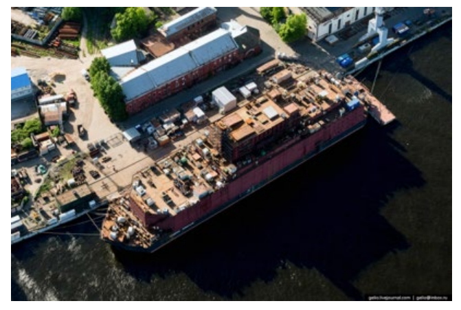
Barge (140m long x 30m wide, 21,000 tonnes displacement) with 2 x 35 MWe SMRs under construction in St Petersburg.

Russia has used nuclear powered icebreakers for many years, and in 2007, a project was started to install two KLT-40S 35 MWe icebreaker reactors on a non-powered barge to provide floating power for remote areas in Russia. Construction was completed in 2018 at the Baltic shipyard, St Petersburg.